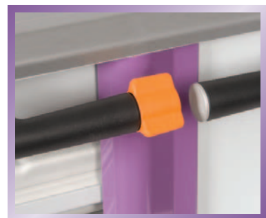
Thumb Activated Control