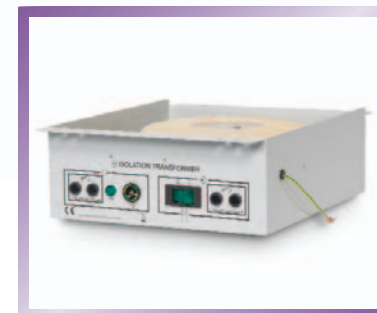
Medical Grade Isolation Transformer

Our clients include leading companies such as Karl Storz, Pentax, FujiFilm as pictured above along with Smith & Nephew, Stryker and many more.