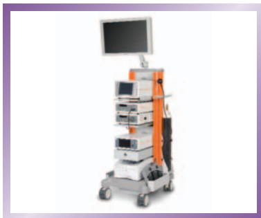
Smith and Nephew